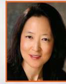
JUDGE ELAINE LU Los Angeles Superior Court KEYNOTE CONVERSATION