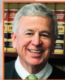
JUDGE DANIEL BUCKLEY Los Angeles Superior Court