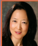
JUDGE ELAINE LU Los Angeles Superior Court KEYNOTE CONVERSATION